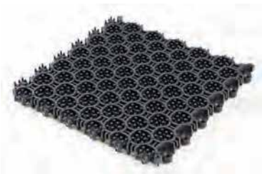
Prior™ 11 mm Closed

The product structure incorporates resilient scrapers to remove particulate dirt. For outdoor applications, the open construction of Prior™ 16 is recommended for drainage.