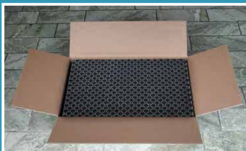
Prior™ pre-assembled in 6 tile units

A specific edging system is available for surface mounted installations.