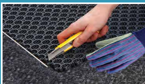
Easy to cut with ruler and knife