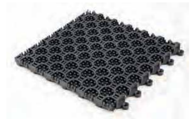
Prior™ 16 mm Closed