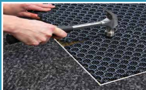
Quick to assemble with a hammer